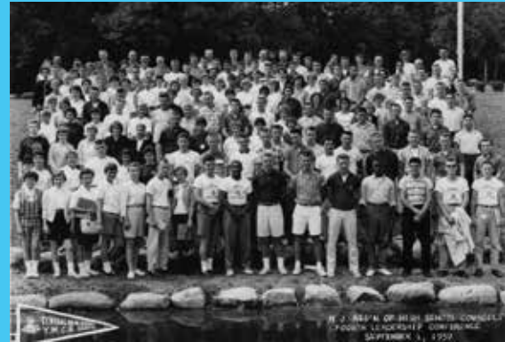
LTC delegates at Camp Ralph Mason, 1959