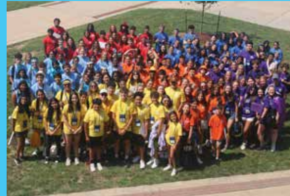
LTC delegates at The College of New Jersey, 2023